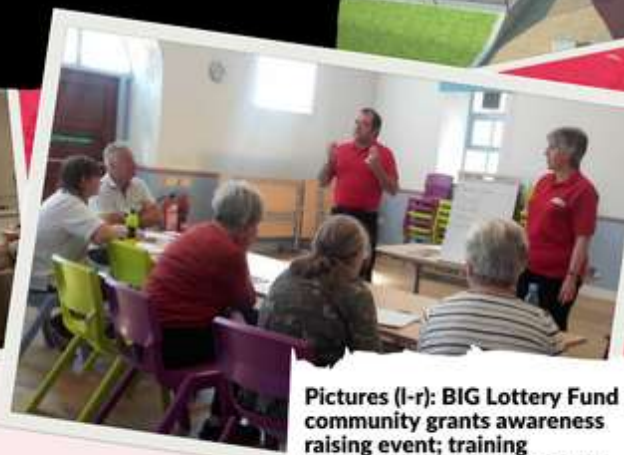
Pictures (l-r): BIG Lottery Fund community grants awareness raising event; training session; Llangefni Skate Park