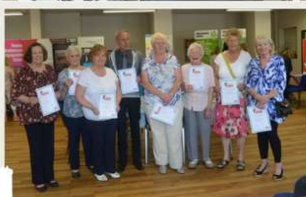
Pictures - top (l-r): The crew at Tyddyn Môn with Rhun ap Iorwerth AM; Medrwn Môn staff discussing volunteering with Môn FM; Pictures - bottom (l-r): Albert Owen MP in Hospice at Home's charity shop during Volunteers' Week; Age Cymru Gwynedd a Môn volunteers receiving certificates during Volunteers' Week. Below: Rhun ap Iorwerth AM with a crew from the Lighthouse, Holyhead, during Volunteers' Week.