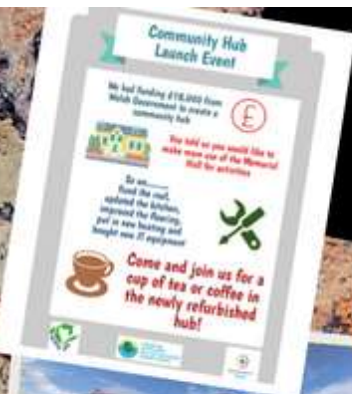
Pictures (l-r): Llanfairpwll Community Hub poster; Llanfairpwll Hub - Llanfairpwll Memorial Hall; Bryngwran Community Hub - lorwerth Arms, Bryngwran